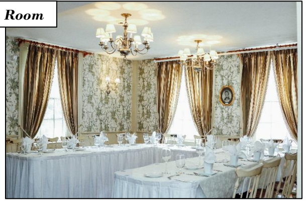
Business U-Shape seating up to 14 people.