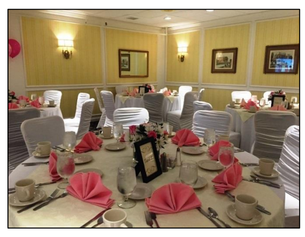
Heritage Room with seating for up to 60