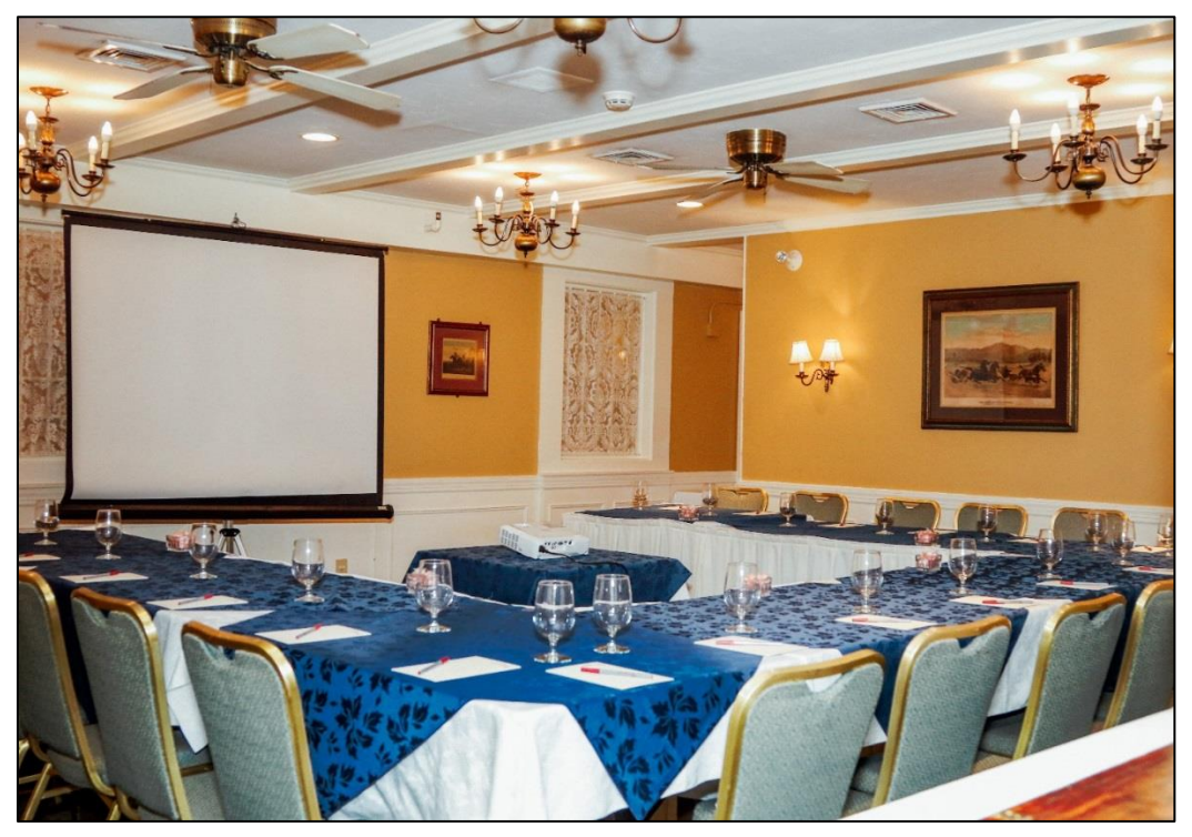
Middlesex Room set U-Shape for up to 16 people

Chocolate Chip Cookies Fudge Brownies Chocolate Covered Strawberries Assorted Bottled Soft Drinks Regular & Decaffeinated Coffee and Assorted Hot Teas