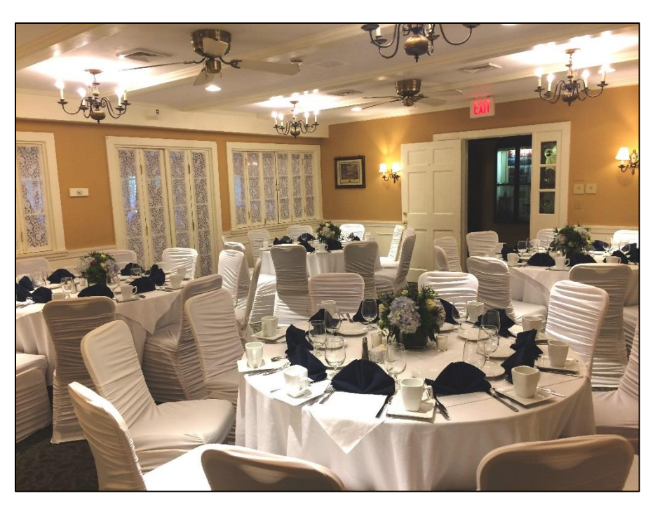
Middlesex Room with seating up to 40 people

Guaranteed Count of Attendance, with Split Count of Entrees, is Due (7) Business Days Prior to Your Event Date