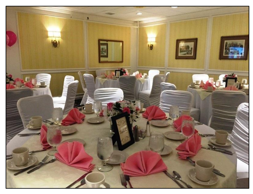
Heritage Room with seating for up to 60 people